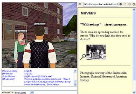
Figure 1: Talking with an Agent