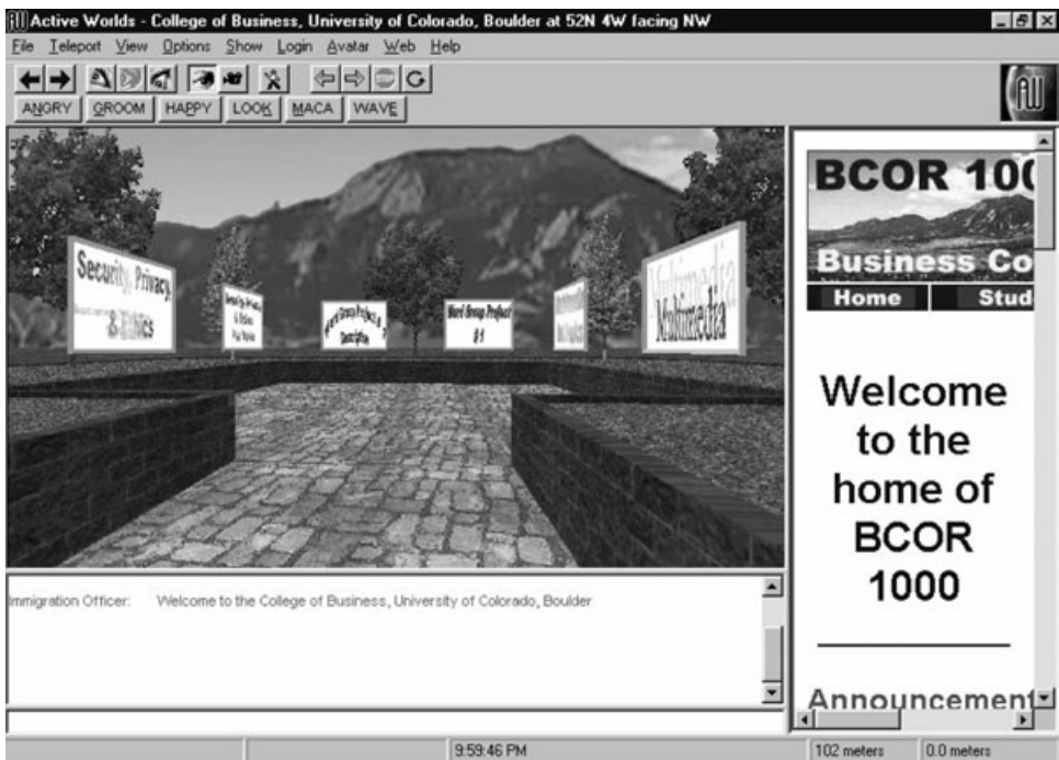
Figure 2: A patio for collaborative assignments

to meet and collaborate on group projects (see Figure 2). Additionally, each patio contains signs that are hypertext links to web-based resources for the group projects. Whilst the 3D environment provides the interface, context, and environment for spatially distant learners to meet and interact, the web browser delivers content and resource information, as well as provides the means by which students submit work and receive feedback about assignments.